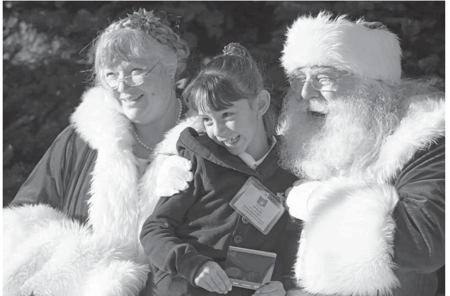
Last week, Mattel hosted its fourth annual "12 Days of Play," a global series of holiday-themed events. This year, Mattel gave the gift of play to more than 100,000 children in more than 30 countries. In L.A. County, thousands of employees volunteered at inner-city elementary schools and the Mattel Children's Hospital at UCLA, as well as Habitat for Humanity and LA Area Regional Food Bank.